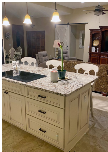
We are neighbors with Stephanie's parents!