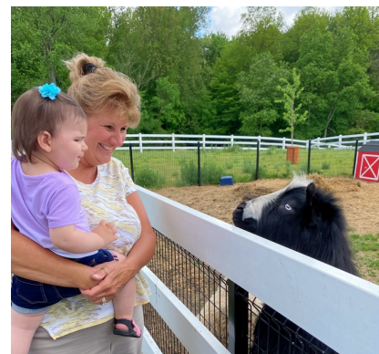
Our neighbors have a mini farm! Yay!