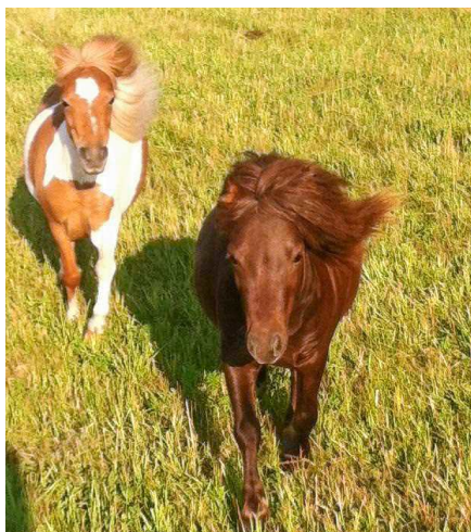
Winnie & Tuck