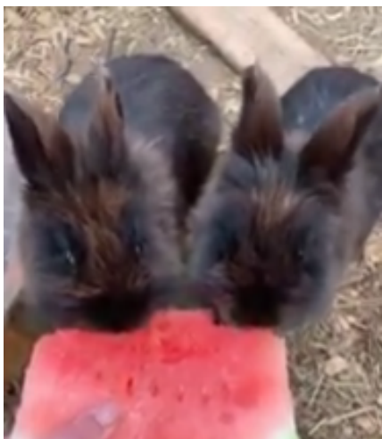
Thelma & Louise