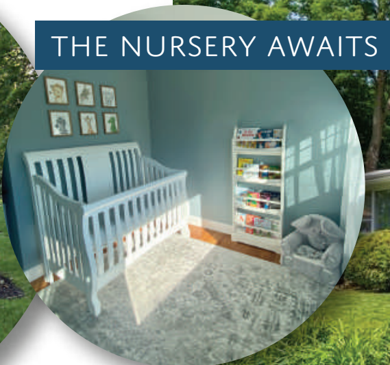
THE NURSERY AWAITS