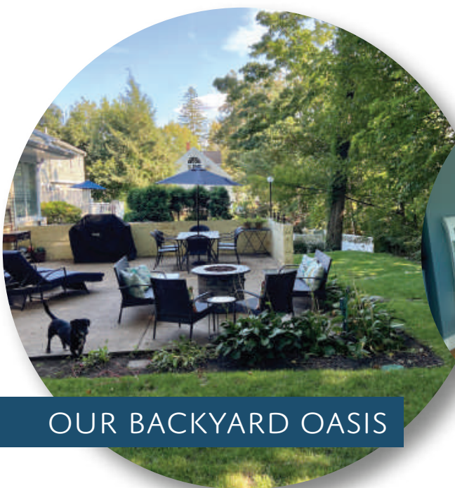
OUR BACKYARD OASIS

We live in a quiet New England town with great schools and beautiful parks nearby. We love walking downtown to enjoy delicious meals or strolling to coffee with our pup, Dudley. Our community is incredible and always offers fun family events. We're close to the coast for magical beach days and not too far from the mountains for stunning hikes. We love our home for so many reasons, but we love it the most because of the love that fills it. We cannot wait for a little one to join in on our regular game nights and soak up the time in the summer on the patio cooking up some yummy barbeque. We look forward to making new traditions with our little one, like make your own pizza night and decorating for the holidays. We know we will have a million milestones to celebrate with our kiddo in our home, and we can't wait to see it all unfold!